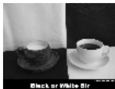
Black or White Sir

Week 15 'Abandoned' 'Postscript' Graham Hale