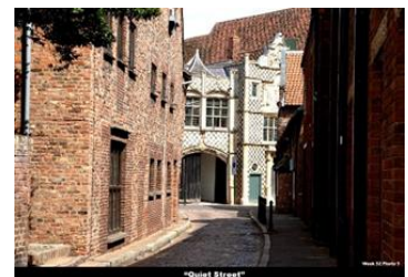
Week 32 – Architecture Neil Rowe