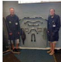
Sporting equipment board