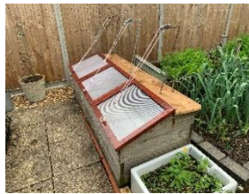
Cold frame windows