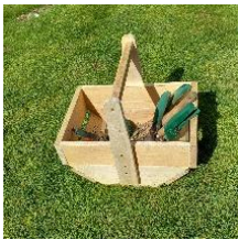
A Garden trug