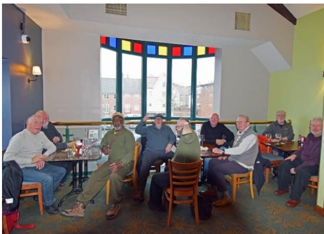
The Glass House