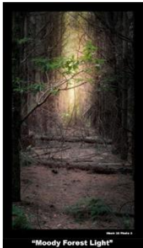
'Moody Forest Light'

Week 34 – 'Textures' 'Blakeney Mud'