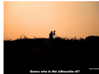
'Guess who is the silhouette of?'