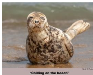
'Chilling on the beach'