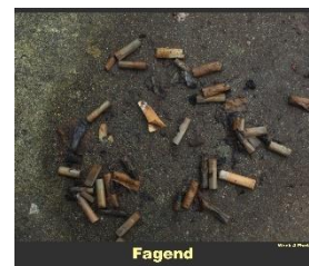
Week 4 Photo 1 Fagend

Week 3 - 'Rain' 'A Splash of Ice' – Steve Franz 'My Butt is Full' – Stewart Haile