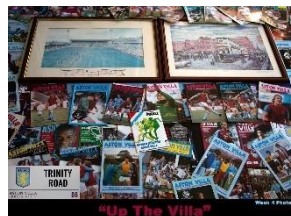
Week 1 Photo 6 "Up The Villa"