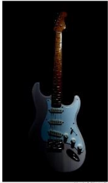
Week 1 Photo 6 Guitar Practice

The members of the photographic cohort have now progressed to week 4 of their 2022 challenge. Here are the winners of the Terry Knight Photo Memorial Certificate from recent weeks: