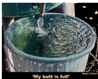
Week 3 Photo 6 'My butt is full'

Week 3 - 'Rain' 'A Splash of Ice' – Steve Franz 'My Butt is Full' – Stewart Haile