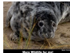
Week 1 Photo 6 More Wildlife for me!