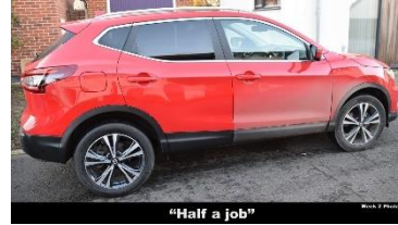
Week 2 Photo 7 "Half a job"

Week 1 'New Year's Resolution / Goal' 'Guitar Practice' - Steve Franz