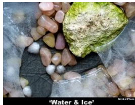
Week 1 Photo 1 'Water & Ice'